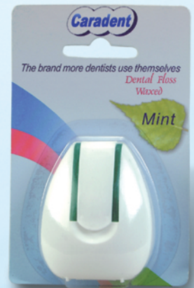
Printed card package